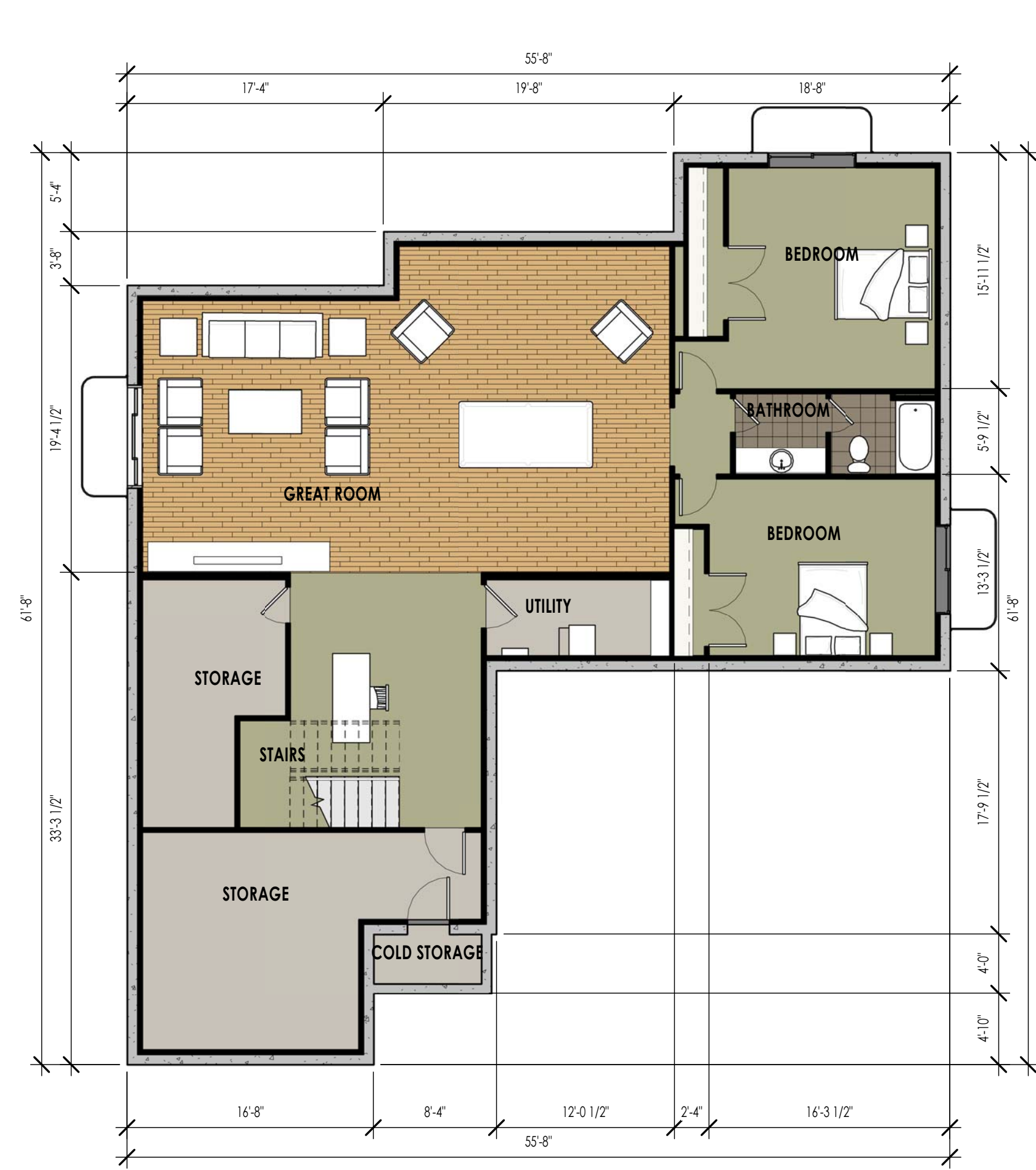
LEVEL 0 - SCHEMATIC BASEMENT PLAN