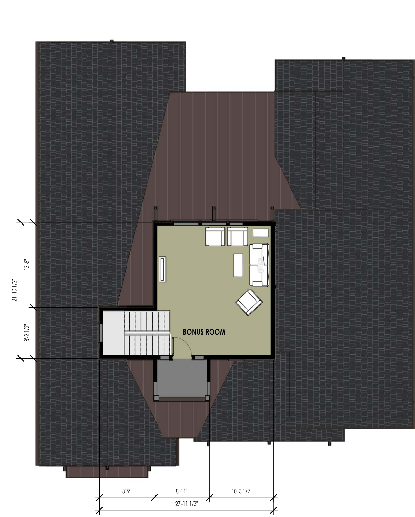
LEVEL 2 - SCHEMATIC UPPER FLOOR PLAN